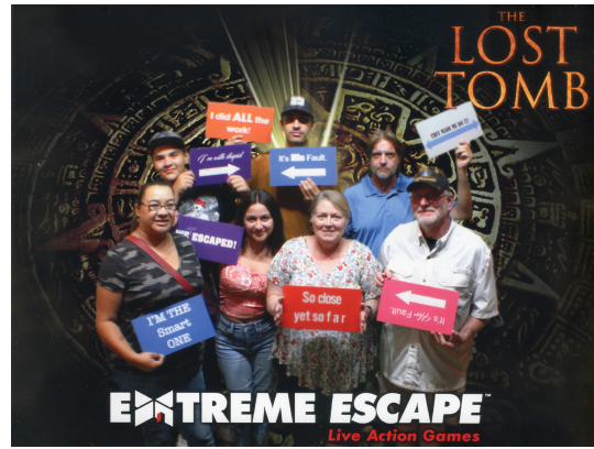
the Great Escape crew