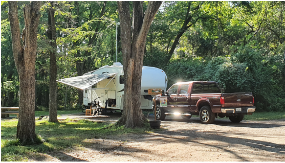
One of our Campsites